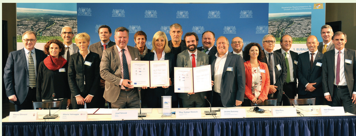
Alpine region representatives celebrating the foundation of the network in Munich

Green infrastructure offers economically sound solutions in harmony with nature.